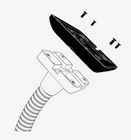
Step 2 Attach the Touch holder to the stand and screw in the x4 screws to secure.