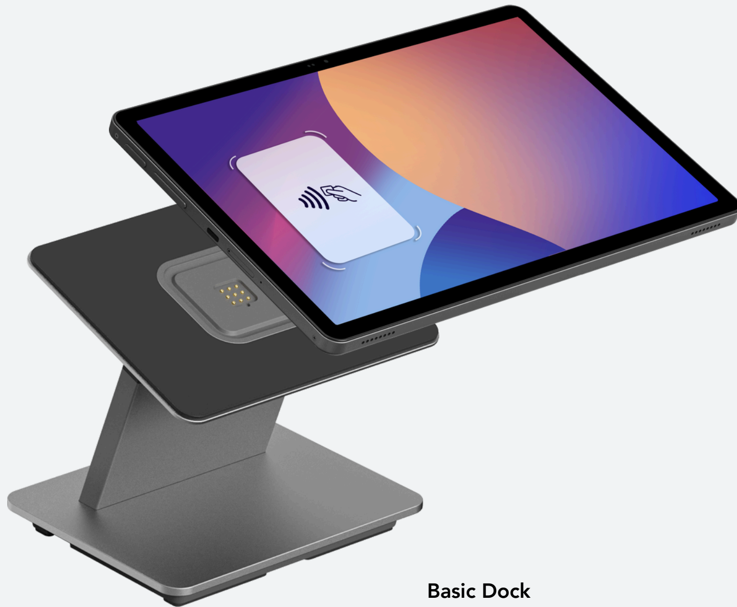
Basic Dock A basic stand for reliable docking

Falcon 2 is integrated with a magnetic dock design so that it can easily attach onto different docks to give a completely different experience.